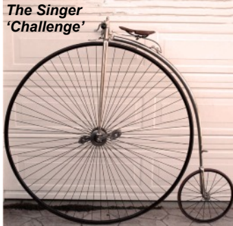
The Singer 'Challenge'

Singer & Co manufactured high quality bicycles. In 1894 it was renamed Singer & Co Ltd , changing in 1896 to the Singer Cycle Co Ltd . In 1903, with motor cars on the horizon, its name reverted to