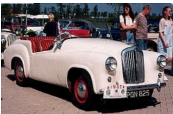
1954 - SMX Roadster