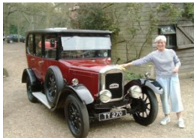
1925-1926 Singer 10/26

1926 was a significant year for Singer, when the Junior was introduced. This had a new, 848 cc overhead camshaft (ohc) engine, the basic design layout of which was used in the majority of Singer's subsequent models, and can still be