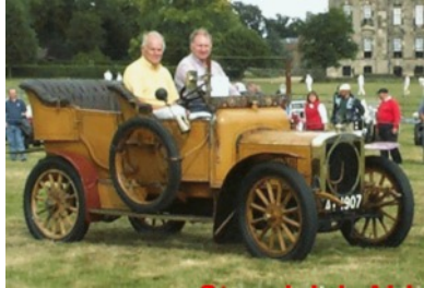
1907 Singer 12-14 HP

The first Singer motorised vehicles. In 1900 Singer obtained a licence to manufacture the Perks & Birch 'Motor Wheel'. This was a fabricated aluminium wheel, driven by a built-in, 2 hp engine. Motor Wheels were fitted to bicycles and tricycles with strengthened frames. Production continued until 1904-05, with several variants, including a milk churn carrier, a 'Governess' type body, a Tri-Voiturette, and the Fore-Car, predecessor of the Tri-Car.