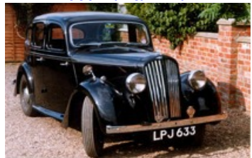
1937-1948 - Ten & Twelve