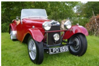
1938-1956 - Engines for HRGs