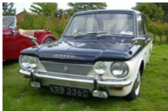
1964-1970 - Chamois Mk 1 & 2