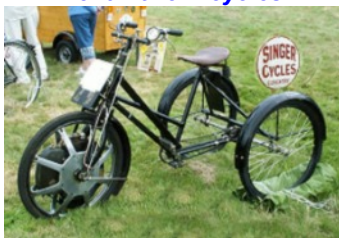
1901-1904 Motor Wheel