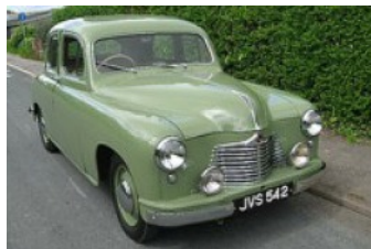
1948-1954 - SM 1500