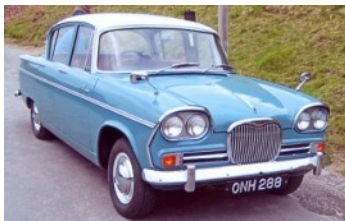
1961-1966 - Vogue Mk I - Mk IV