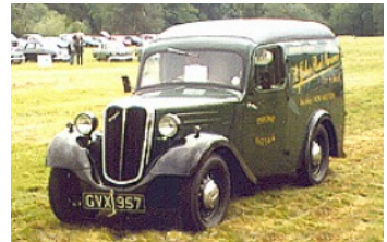
1939 Bantam Van