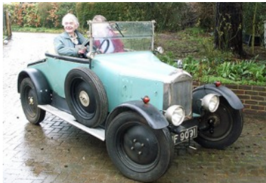
1912-1924 Singer 'Ten'