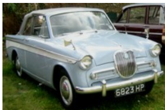
1956-1966 - Gazelle Ser I - VI