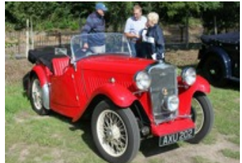
1933-1937 Sports/Le Mans