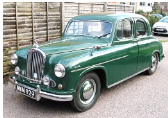
1954-1956 - Hunter