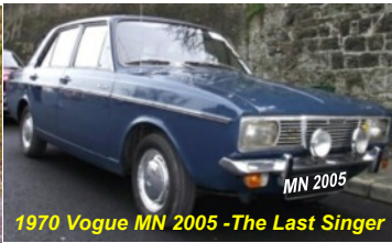
1970 Vogue MN 2005 - The Last Singer